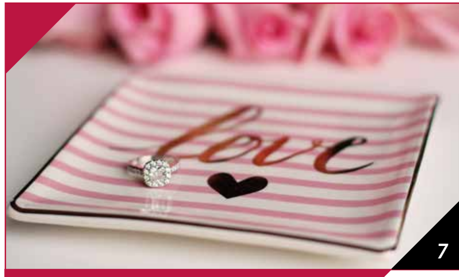
Preparing For Your Wedding - Is it time for a Pre-nup?